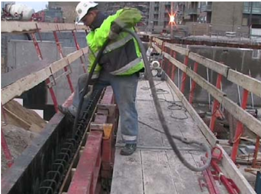
D: The hose is almost up