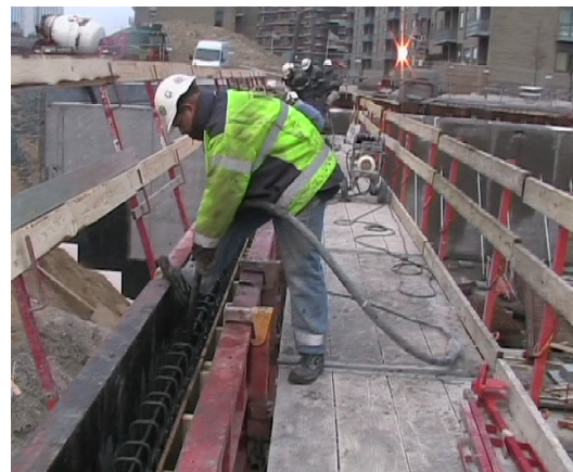
C: It takes about 5-10 seconds