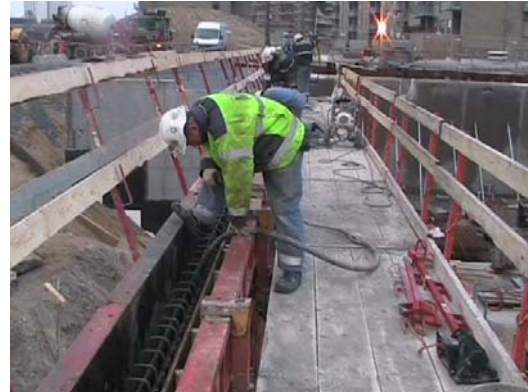
A: Waiting time

The photos of operation positions are shown in Figure 2. The three persons use practically the same technique and even though they from time to time vary their operating position by standing with one leg on each side of the mould, it does not change the total physical loading.