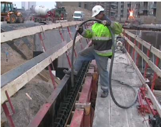
E: The hose is carried to the next entrance