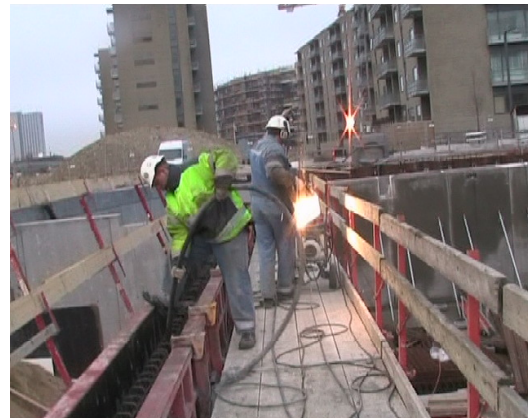
B: The hose is hauled up