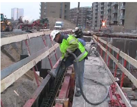
F: The hose is lowered again